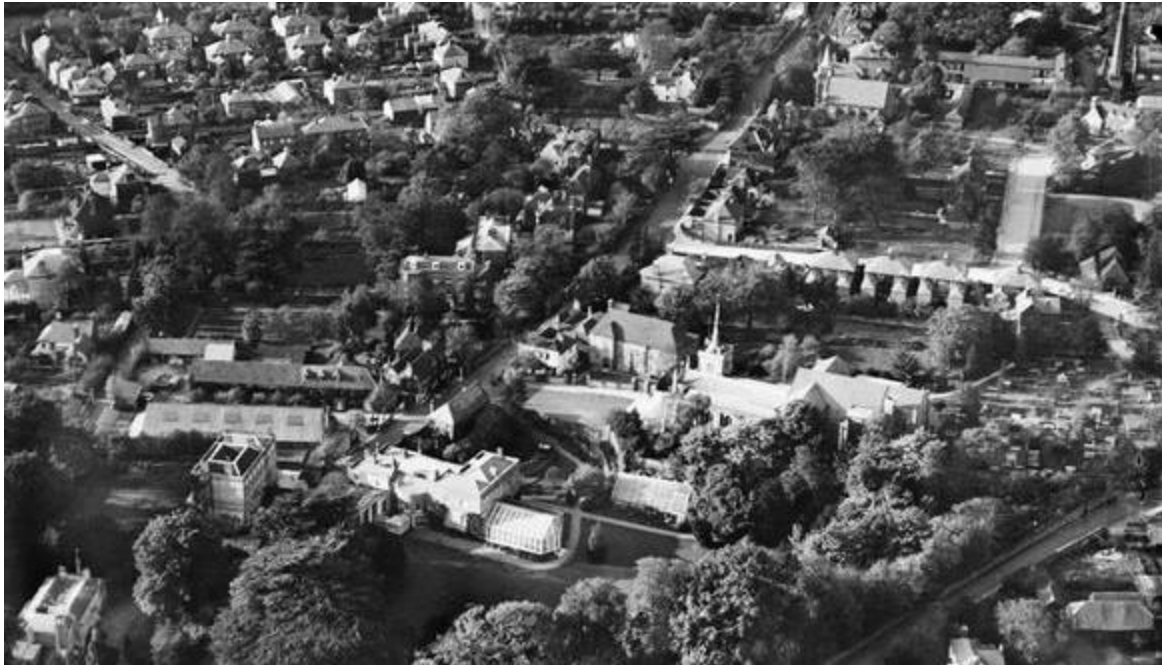
Figure 5 – St. Martin's Church with Church House at 9o'clock to the spire – October 1928